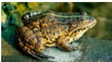
Formby nature reserve encompasses a diverse landscape, from pine woodland to a stunning beach, one of the largest dune systems in Europe, covered by marram grass, and with amazing coastal vistas. The rare natterjack toad breeds in warm, shallow pools on dunes and sandy heaths in just a few UK locations and is smaller than the common toad.