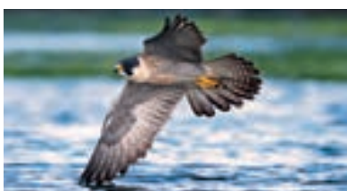
Loughrigg Fell, Cumbria and Peregrine Falcon