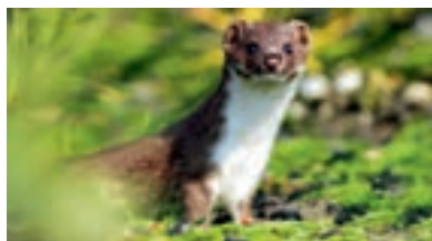
Sunlight illuminates a field of scarlet poppies, which thrive in uncultivated fields, producing a vibrant carpet of colour. Situated near Hadrian's Wall, Corbridge was once the most northerly town in the Roman Empire, known as Coria. The weasel is the UK's smallest carnivore, making its habitat in lowland pasture, woodland, marshland and moors.