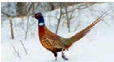
Somerset is characterised by a diversity of landscapes, ranging from the high open remote downland, ancient forests and woodland, and dramatic steep escarpment slopes, to more secluded chalk river valleys. The pheasant is common here. It rises rapidly in the air almost vertically if disturbed from its nest in the undergrowth, with wings whirring and a loud crowing.